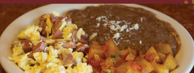
Huevos Con Salchicha $6.99 Scrambled Eggs with Sausage.