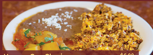
Huevos Con Chorizo $6.99 Scrambled Eggs With Mexican Sausage