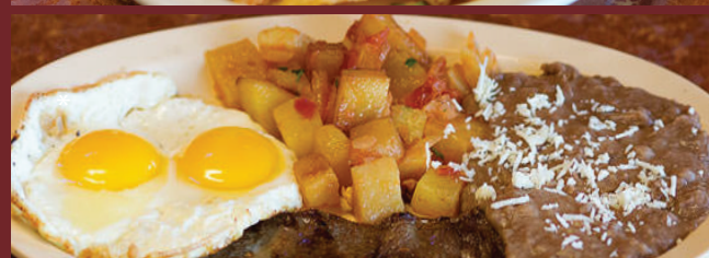
*Angel Super Breakfast $11.99 2 Eggs with Sliced Steak