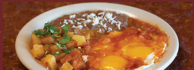
*Huevos Rancheros $6.99 Scrambled Eggs with Onions, Tomatoes, and Jalapeños