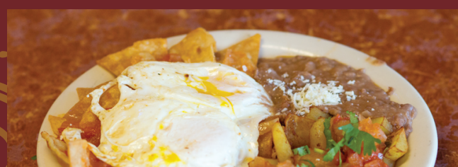
Chilaquiles $9.99 Chilaquiles