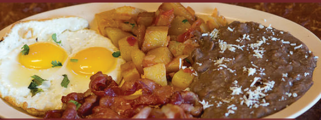
*El Mananero $6.99 2 Eggs With Slice of Bacon