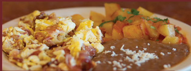
Huevos Con Tocino $6.99 Scrambled Eggs With Bacon